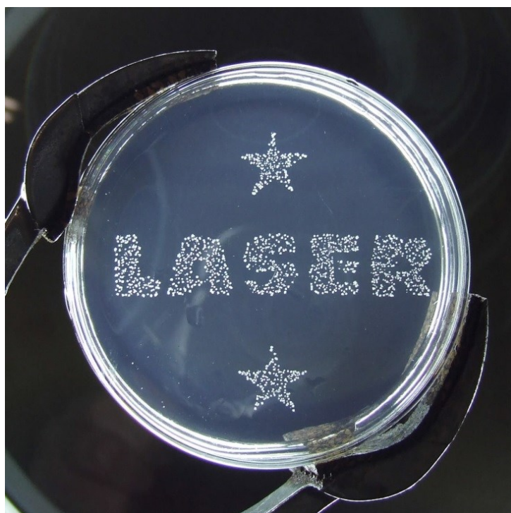
← Figure 1. Photograph showing spatial control of laser-induced nucleation of KCl in an agarose gel. The pattern, showing the word “LASER” with stars above and below, was obtained using an optical mask. No crystals were observed in the regions that were masked. The diameter of the dish was 9 cm (see text for further details).

The control we have demonstrated is limited by localization of the laser pulse. The nucleation within the illuminated region is stochastic, however, since it depends on the distribution of pre-nucleating (sub-critical) clusters. We have observed that simple focusing of the beam can lead to damage of the gel at higher laser powers. Two low-power beams can be combined to induce nucleation where they are crossed, opening the route to three-dimensional control of nucleation. The simple technique could be easily developed to a wide range of systems, such as nonaqueous gels or in droplets. 5,13 Recent developments in optical methods could be applied to improve localization within a solid matrix. 14