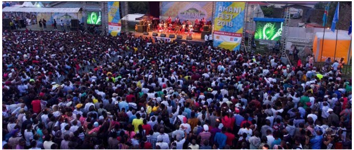
Video 1. Amani Festival 2018, “after movie.”

Amani Festival is, first and foremost, resting on a strong contingent of over 700 hundred volunteers. They are overwhelmingly young Congolese aged between 18 and 25 and the core group is engaged in different activities at the Foyer Culturel , a local youth centre promoting music activities throughout the year. The festival belongs to them and they are determined to make something of it that doesn't resemble the factionalised and violent environment in which they grew up. The festival did not create a strong base in the population, it is very much made of, by, and for its prime audience. Of course, not everybody is involved at the same level, but the volunteers of the Foyer Culturel maintain a strong engagement with their neighbours, friends, and families through a round-the-year song contest (whose winners sing at the festival) and mobile concerts in the different parts of town.