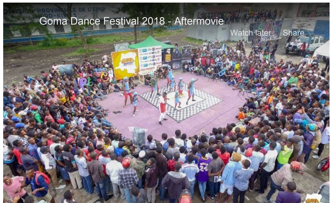
Video 2. Goma Dance Festival 2018, “after movie.”

Pinpointing the precise effects of the festival on peace and stability in Goma is an arduous endeavor we just started. What is, however, clear to us is that the core achievement of the festival has been to act as an incubator for doing things differently: up and coming artists have used Amani’s stage to forge a path of their own, young entrepreneurs have used the event as a stall to reach new audiences, and volunteers have been inspired to develop their own initiatives. One striking example of such initiatives is Goma Dance Festival, a yearly hip hop festival created by Amani Festival volunteers.