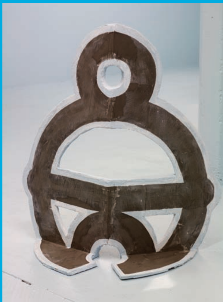
Mick Peter Trademark Horizon , 2013 (installation view).