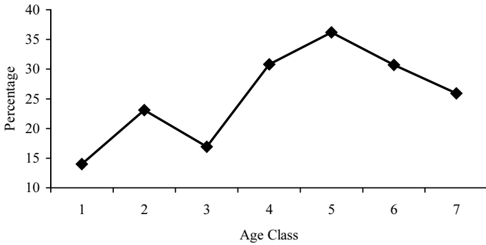
Figure 1. Linear model solutions for age effect on spontaneous, out-of-season ovulatory activity; 1 = young ewes that had never lambed before; 2 = older ewes that had not lambed in previous season; 3, 4, 5, 6, 7 = ewes that lambed for the 1st, 2nd, 3rd, 4th, and 5th or greater time, respectively, in the previous season.