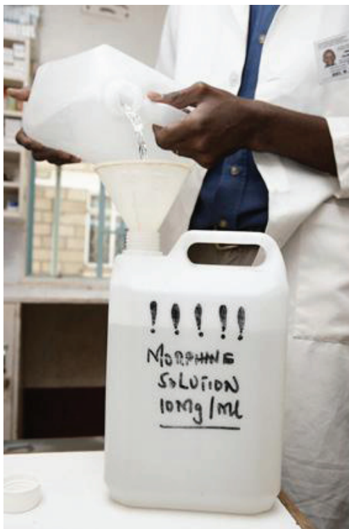
Figure 1 Oral morphine solution being made from powder in the hospital.

Staff and patients spoke of how the presence of the palliative care team was changing community attitudes to death and dying. Though the task was uphill, as one nurse explained, "We try to teach the reality, but people expect cure and treatment. They expect miracles" , the team though spoke of the trust that patients and carers had in them, and the acceptance that care can be much more than cure. The palliative care team brought expert knowledge about the nature and the effects of diseases into local communities, where such knowledge was previously absent, and while stigmatisation still occurred, especially for patients cancers, there was at least a greater acceptance.