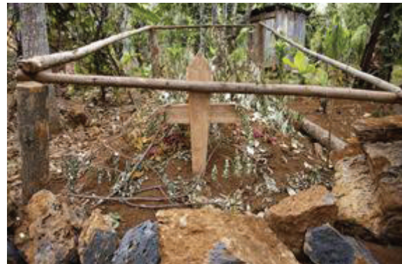
Figure 3 A fresh grave in the back garden after a home death.

As with both other programmes the presence of the palliative care teams in the community had shifted attitudes towards those who are dying, enabling families and the community to provide more comprehensive