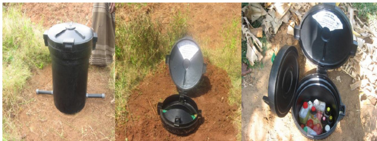
Figure 3 Safe storage device for agrochemicals in Sri Lanka. The UV-resistant plastic pesticide storage container to be used in this study. A) Device before installation: the metal bar at the base secures the device from theft. B) Device buried with two lids to protect the padlock from weather damage. C) Device can store several large and small bottles of pesticides.

pesticide self-poisoning, both fatal and non-fatal, amongst villagers aged 14 years or older, over the three-year study period. Secondary outcomes will include the incidence of: pesticide poisoning in general (deliberate and accidental, all ages), self-harm (all methods, both fatal and non-fatal), self-poisoning (all substances) and pesticide poisoning in children (younger than 14 years).