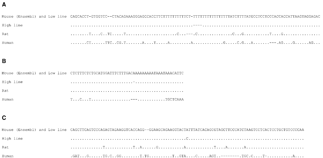
Figure 3. Polymorphisms between High- and Low-Line-Derived Chr X

(A) 80 bp from the stop codon of Gpc3 in the 3' UTR.