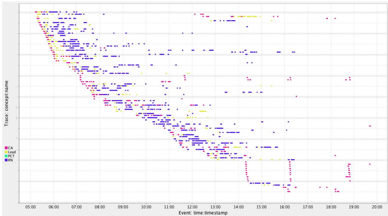
Figure 2: Dotted chart for Day 2. The x-axis is divided into hours of the day and each row represents a patient. Each colored dot corresponds to a log file event from personnel in PreOp. The colors are based on personnel roles.