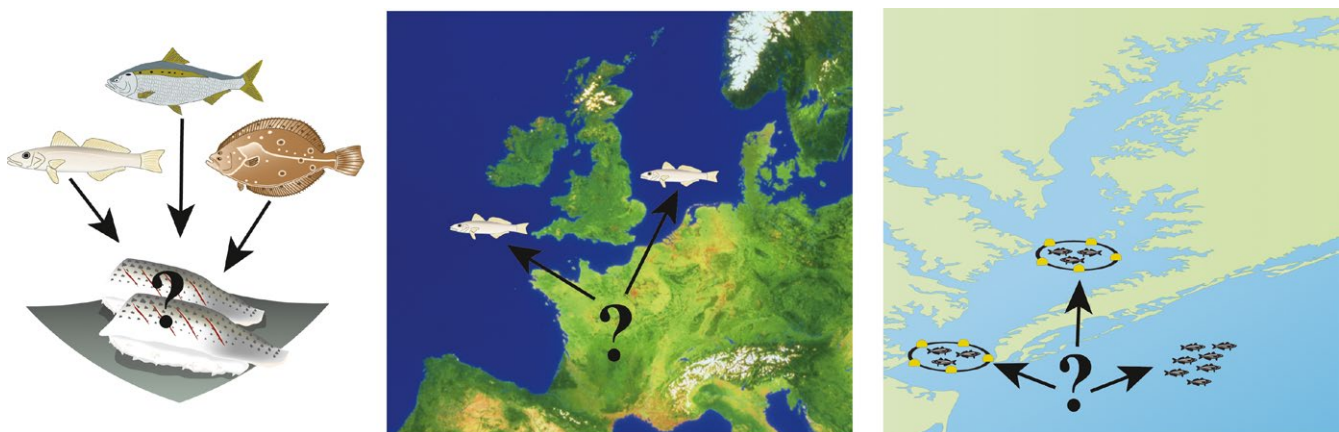
FIGURE 1 Three essential questions, relevant for fisheries control and enforcement and traceability along the supply chain are “What species?” (left) “Where captured from?” (middle) “Wild or cultured,” including “Where did it escape from?” (right). The genetic distinction between wild and farmed fish, which overlaps with challenge depicted on the right, will become more relevant in the near future, due to the steep rise in aquaculture activity worldwide and the interaction between cultured and wild conspecifics. See text for details. Fish symbols courtesy of the Integration and Application Network, University of Maryland Center for Environmental Science. European Map: © European Union, 2010

With the increase in international trade of fish products (Asche, Bellemare, Roheim, Smith, & Tveteras, 2015; Gephart & Pace, 2015),