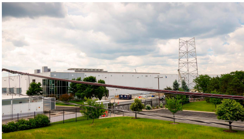
Figure 1 The datacentre of the Chicago Mercantile Exchange, the most important in global finance. The microwave dishes via which signals from this datacentre travel to New Jersey and elsewhere, which are currently in a variety of locations close to the datacentre, are being centralized on the pylon under construction on the right of the picture. Source: courtesy Bird & Renoult. See http://bird-renoult.net/antenna-gods-us-edition-2018/ .

Although the internal spatial layout of datacentres varies, there is considerable structural similarity among exchanges' technical systems (see Figure 2 ). The heart of any modern electronic exchange is its 'matching engines'. These are computer systems that maintain the 'order book' for each financial instrument that the exchange trades. For a 'human-eyes' visual representation of an order book, see Figure 3 , but all modern order books are simply data files: