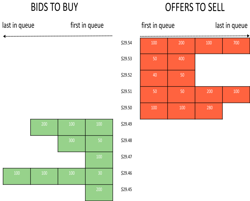
Figure 3 An order book.

orders in the book. Consider the order book in Figure 3. A bid to buy shares at $29.49 would be a ‘making’ order. The matching engine cannot execute it immediately, because there are no offers to sell at that price to match it with. Instead, the matching engine would simply add it to the order book’s queue of bids at $29.49. In most exchanges, that queue is a time-priority list: a new bid to buy at $29.49 will be executed only when all earlier bids at that price have been executed or cancelled. In contrast, a bid to buy at $29.50 would be a ‘taking’ order. The matching engine can execute it straightaway (perhaps only partially if it is large), because there are offers to sell at that price. Doing so removes these existing orders from the book: hence the terminology of ‘taking’.