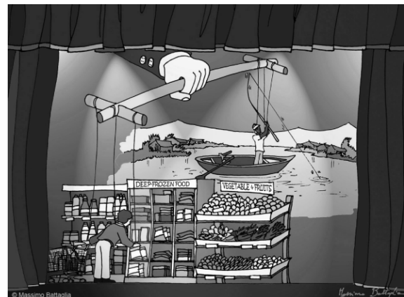
Figure 2 Interlinked ecosystems.

participants. This way of working made an impact on the participants by raising their awareness of a multiplicity of alternative views and by fostering their interest in listening to the voices of others. It is important to note that this activity was not to be taken as a premise for stimulating counter-oppositions and argumentation aimed at selecting the most convincing and/or truthful statement. Rather it was introduced to stimulate an initial awareness of the limitations of any single interpretation. We refer here to the power of humour, as proposed by Bateson (1980) to uncover one's own cultural framings and thus to generate learning potential from the process of enacting dialogue between a plurality of ways of seeing to recognize, in line with Hirst (2013), what is not visible, the unspoken, the unsaid, the assumed and the accepted. Stimuli from the vignettes encouraged students to think about the puppeteer as a metaphor for power: the power of those who can move large-scale flows of materials around the world; but also the power of the students who become aware of themselves and their role as consumers and inhabitants of the living web.