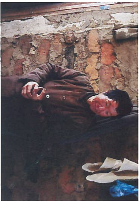
Survival Song, (2008) Yu Guangyi