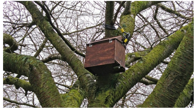
Figure 1. ACD box installed in tree

as they do not require screws or other fastenings to be embedded in or fixed to the trees. When the devices are in situ , we need to visit them periodically to exchange the battery. The box design enables secured easy access for this task.