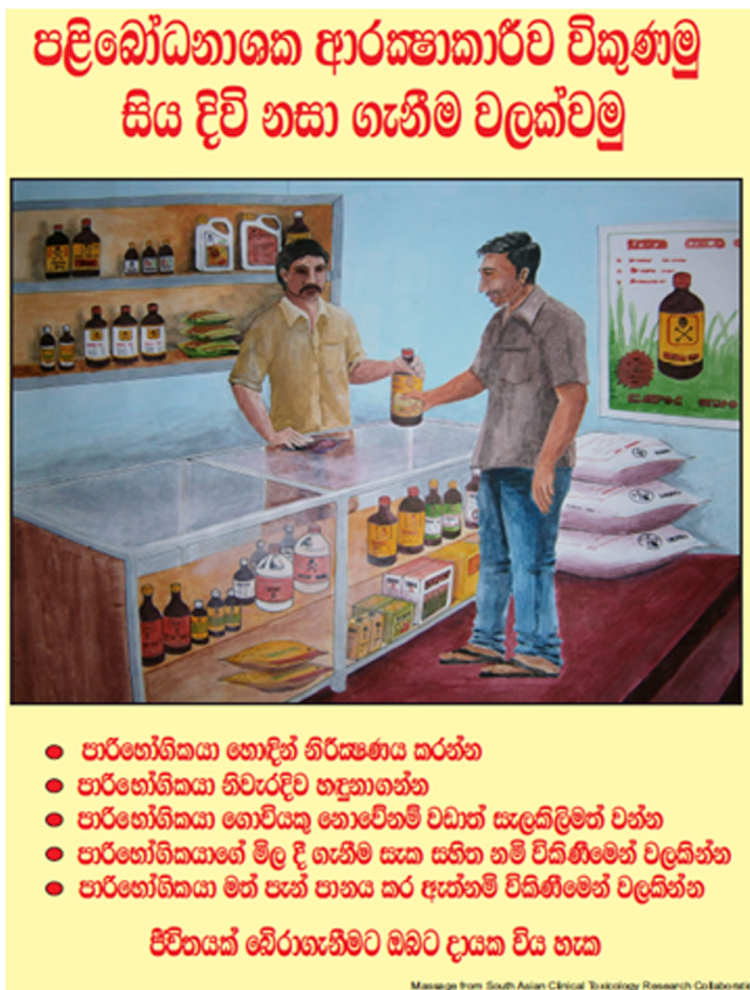
Fig. 2 A reminder poster distributed among vendors. It reminds to vendors to make observations, identify customers' intention, check farming status, not to sell suspicious customers and not to sell alcohol intoxicated customers