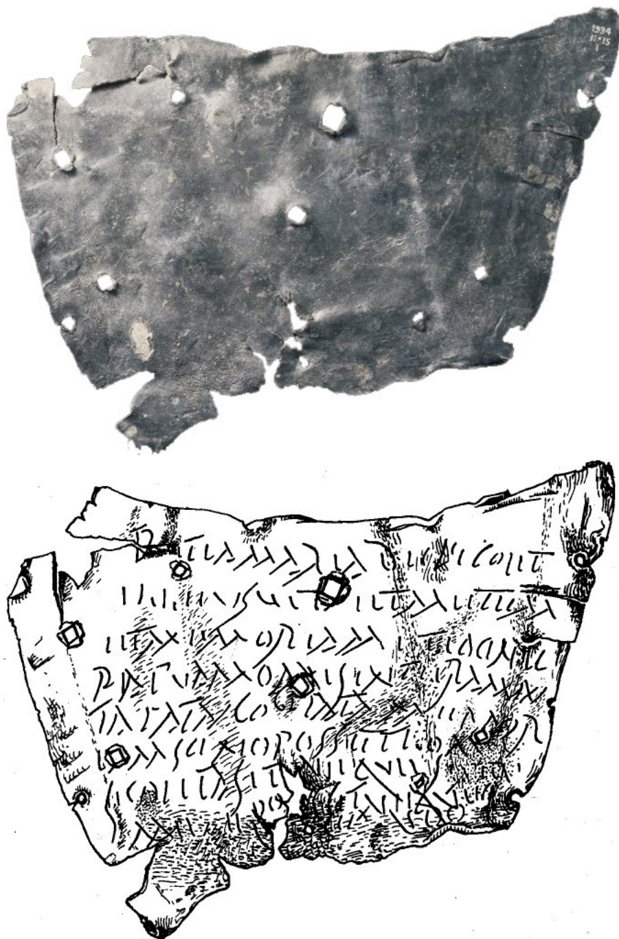
Fig. 5a and Fig. b: Lead curse tablet ( defixio ), c. 1–4C, discovered on Telegraph Street, Moorgate, London. British Museum, London. Museum number: 1934,1105.1. Photo and drawing: The Trustees of the British Museum.