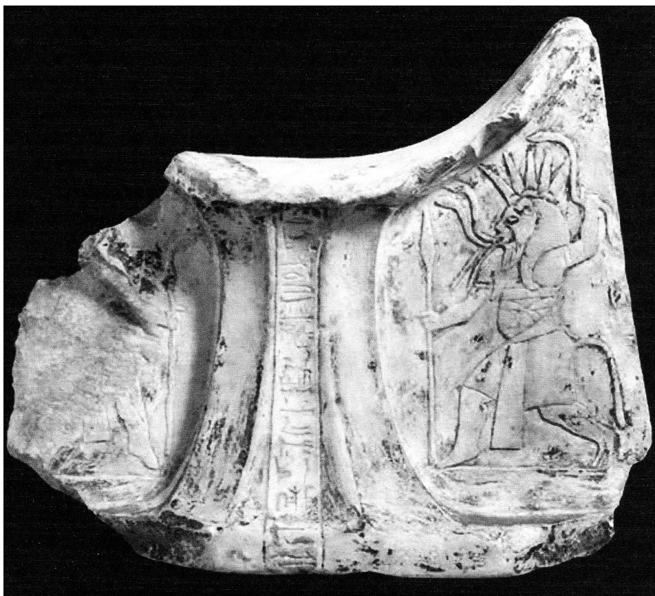
Fig. 2c. Headrest of Qeniherkhepeshef, carved with protective figures of Bes, 1225 BC, 19th Dynasty, Deir el-Medina, Egypt. Limestone, 18.8 x 23 x 9.7cm. British Museum, London. Museum number: EA63783.

Chester Beatty III, sheet 3, recto, columns 8–11). His funerary head-rest depicts the grotesque dwarf-god Bes, waving snakes to fend off dreams (Figures 2b and c); the inscription reads: “a good sleep within the West, the necropolis of the righteous” (Pinch 1994: 43, 58–59; cf. Milne 2010: 178). Many such head-rests, used into the Roman era, have been found; some ceremonial and destined for tombs, others used in everyday life. An early and popular protection against nightmares was thus to repel the demon with a representation of itself.