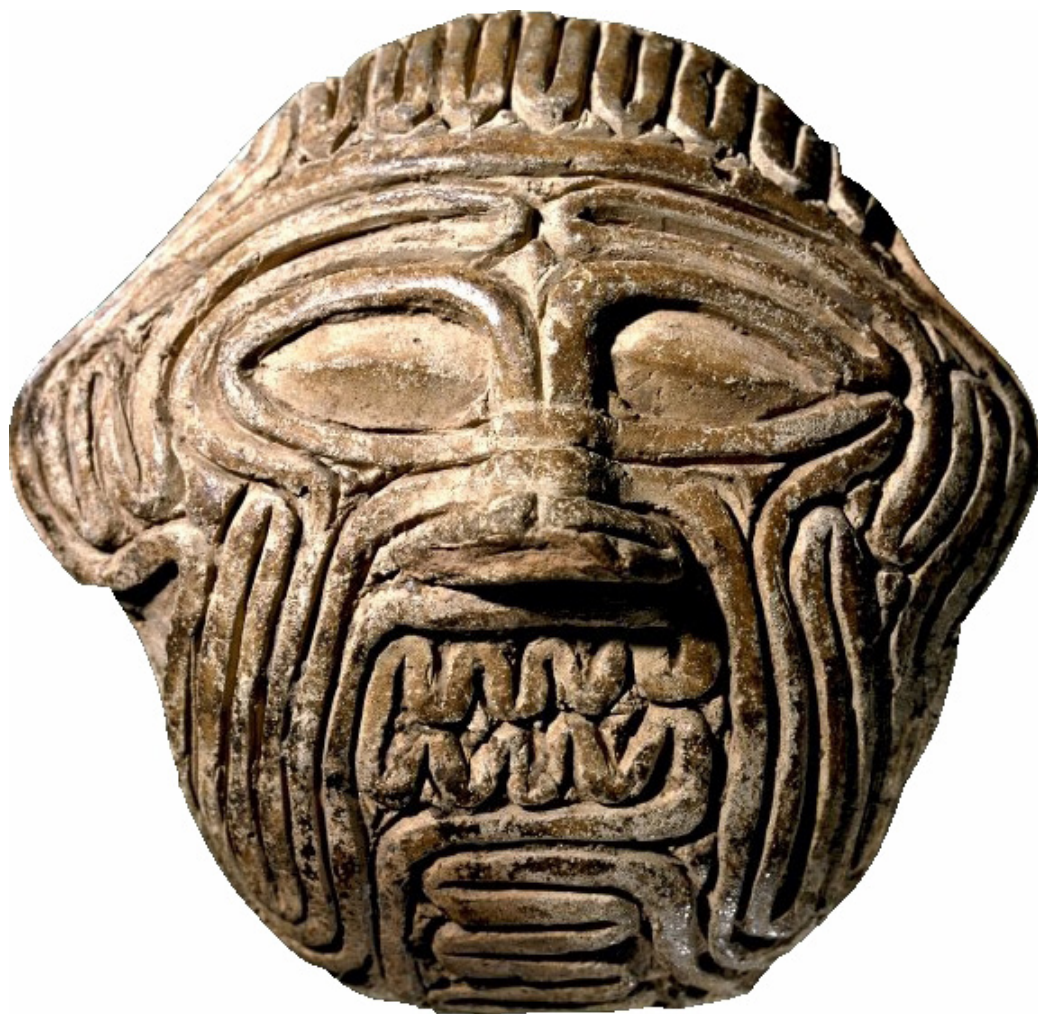
Fig 1a: Humbaba, 1800BCE–1600BCE (Old Babylonian), Abu Habba, South Iraq. Fired clay mask. 8.3 x 8.4 cm. British Museum, London. Museum number: 116624.