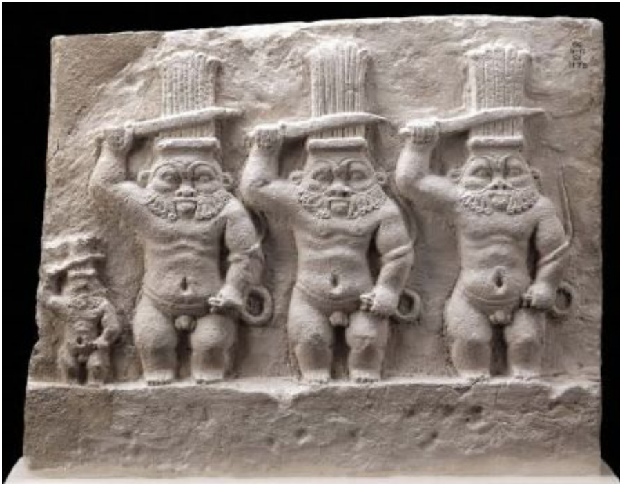
Fig. 2b. Headrest of Qeniherkhepeshef, carved with protective figures of Bes, 1225 BC, 19th Dynasty, Deir el-Medina, Egypt. Limestone, 18.8 x 23 x 9.7cm. British Museum, London. Museum number: EA63783.