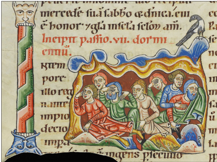
Fig. 3: Seven Sleepers of Ephesus , detail, 1170–1200, Passionary of Weissenau ( Weissenauer Passionale ), 127, fol. 125v. Fondation Bodmer , Coligny, Switzerland Cod.

The midday ones, the nightly, the daily, the bi-daily, the three daily [---] or whatever sort you are: I conjure you [---] you may not have leave to harm this servant of God by day or night, neither waking or sleeping [---]. (trans. Simek 2011: 36).