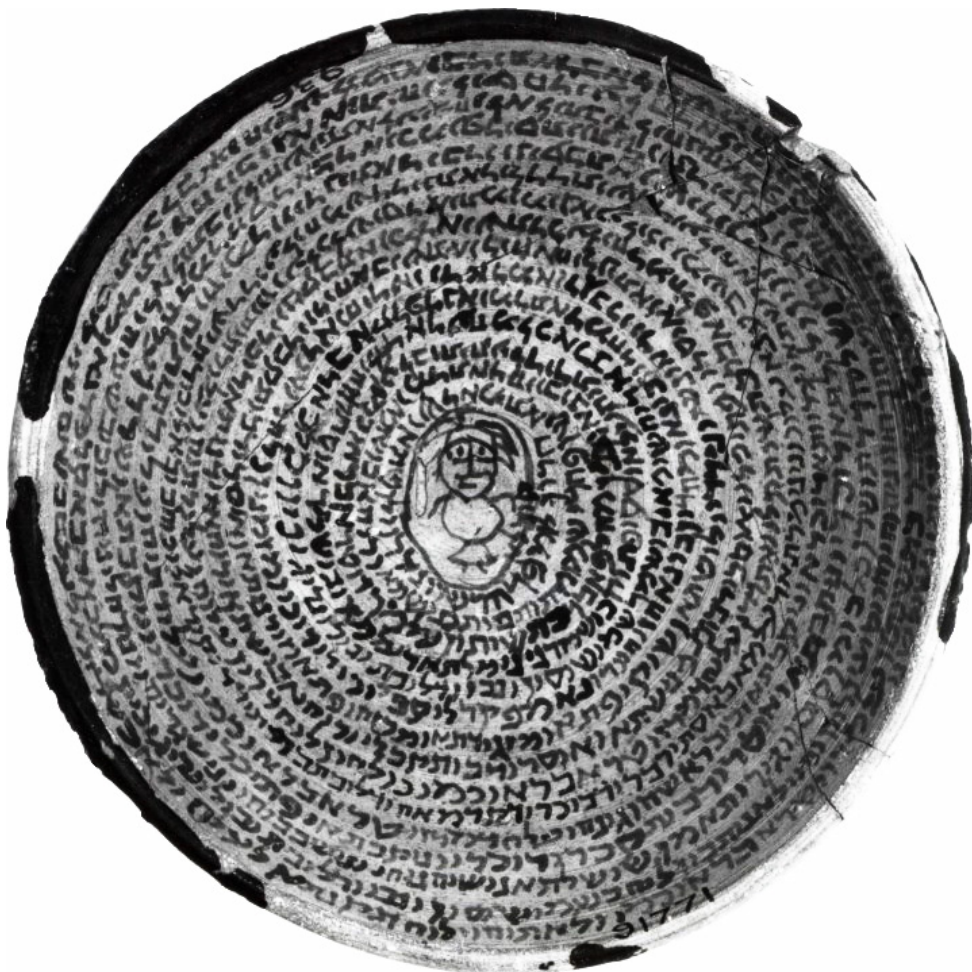
Fig 4: Incantation bowl, 6–8C, Iraq. Ceramic, with Aramaic inscription. 15cm diameter. British Museum, London. Museum number: 91771.