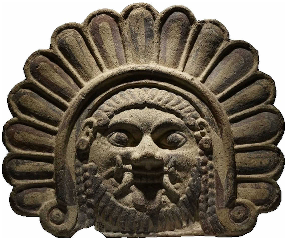
Fig. 1b: Gorgoneion within arched frame, c. 500BC, Campania, Italy. Terracotta antefinial. H: 29 cm. British Museum, London. Museum number: 1877,0802.4.