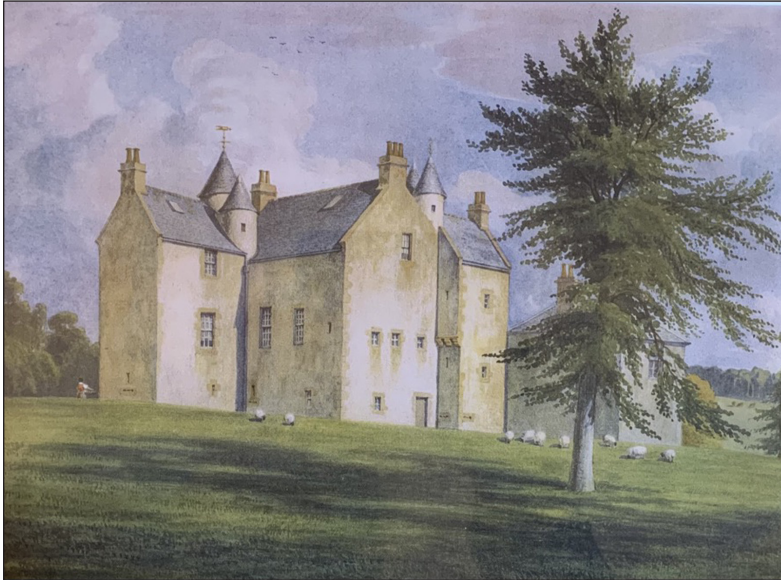
Figure 1: Arnage Castle, 1841 watercolour by James Giles. National Trust for Scotland, Fyvie Castle.

1702 he acquired the lands and barony of Arnage in Ellon at the price of £40,000 Scots. The family moved from their home, now known as Provost Ross's House, which forms part of the present site of the Aberdeen Maritime Museum, to Arnage Castle (Figure 1). Throughout the eighteenth century the Arnage estate included over 2,000 acres of agricultural land. 10