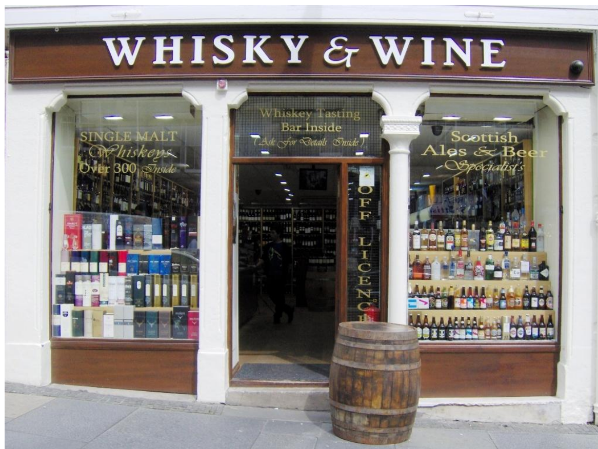
Figure 12 A High Street outlet offering whisky as well as wine and beer (NB. window spelling of ‘whiskey’ in contrast to shop sign ‘whisky’) (from Harwood & El-Manstrly, 2012b)