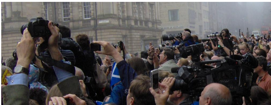
Figure 4 The Queen has arrived (5 th July 2012)