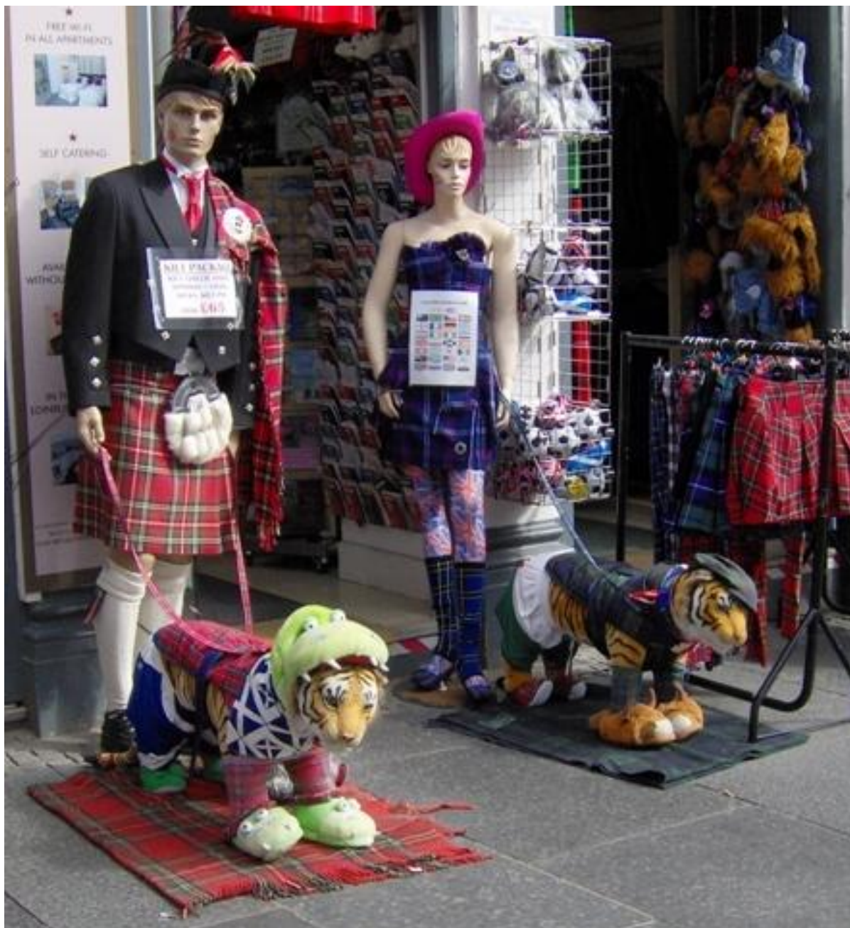
Figure 8 ‘Tartan Tat’? (from Harwood & El-Manstrly, 2012a)