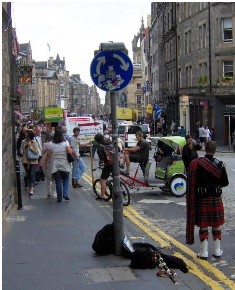
Figure 7 A view down the ‘top’ of the Royal Mile (Lawnmarket) revealing a heterogeneous blend of cultures: Scottish piper, a rickshaw and a hand-held sign directing (red arrow) people to a Kurdish & Middle East restaurant. (from Harwood & El-Manstrly, 2012a)