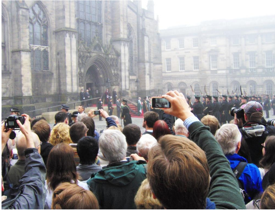
Figure 3 Awaiting the Queen for the Thistle Service of The Order of the Thistle (5 th July 2012)