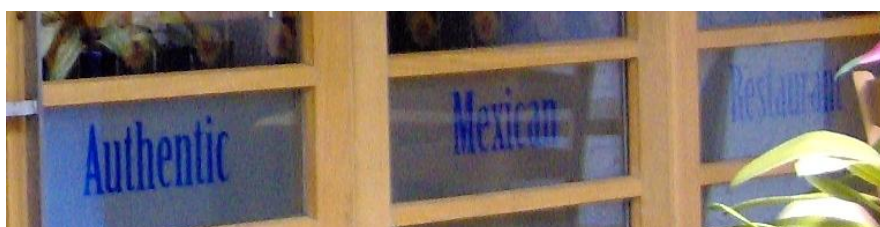
Figure 6 An ‘Authentic Mexican Restaurant’ (taken July, 2012)

The offering also extends to open-topped tour buses, street performers (including Braveheart’s William Wallace who collects for charity), market stalls and stands promoting tours (particularly those that exploit Edinburgh’s alleged reputation as a haunted city). The Royal Mile is also host to a range of pageants, such as the annual opening of the Scottish Parliament, the resurrected annual Riding of the Marches and the biannual Service of the Order of the Thistle. It is also host to one-off events such as the royal wedding of Zara Phillips on the 30 th July 2011. Each year in August, part of the High Street is one of the popular sites of the Edinburgh Fringe festival. Likewise the Castle esplanade becomes a stage for the Edinburgh Military Tattoo. The cosmopolitan fusion of different cultures is revealed in Figure 7, which draws attention to the distinctly Scottish piper, whilst behind is a rickshaw for hire to those who wish to be cycled about town, and a hand-held sign directing (red arrow) people to a Kurdish & Middle East restaurant.