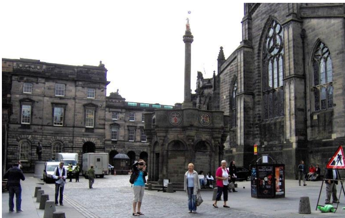
Figure 2 The interplay of Justice (Law Courts [built 1632-9 as Parliament Hall then increasingly used for legal cases, re-fac'd in the 19 th century] with parked white prison vans), Work (roadwork), Religion (east gable of St Giles Cathedral [church first mentioned on site 854, current exterior dates from 1829]), Public gatherings (Mercat Cross [restored 1885, but dates back to 14 th century]) and Tourism (signage promoting ‘scary’ tours [between Mercat Cross and roadwork sign] and tourists [note the photographer in foreground]). [dates provided by Birrell, 1980] (from Harwood & El-Manstrly, 2012a)

The street hosts a rich configuration of buildings, monuments and other structures, some of which date back over 500 years (e.g. the oldest dwelling house is Moubray House, built around 1477 (Birrell, 1980)), whilst others are more recent (e.g. the building of the Scottish Parliament started in 2000, it opening in 2004). Building type varies considerably in terms of age, architecture and function, with residential properties intermingled with non-residential with their many different uses. Indeed, the buildings have housed Scotland’s nobility, intellectuals and murderers to name a few. Moreover the buildings have witnessed many events, of which, today, the annual Edinburgh Fringe Festival and the bi-annual Thistle Service of the Order of the Thistle (Figure 3, Figure 4) are but two. The street accommodates a significant variety of tourism products, as well as a diverse range of other facilities and services that cater for a wide range of non-tourist stakeholders, including residents, both permanent and temporary (e.g. students), workers and both local and national government policy makers. To illustrate, Figure 2 reveals the interplay of both past with the present and also the different functions served such as justice, work, religion, public gatherings and tourism. Figure 3 reveals how tradition lives in the present, but establishes continuity with the past (Hobsbawn, 1983). Moreover, it can be crowd-puller with the world watching (Figure 4), even if the weather is ‘dreich’.