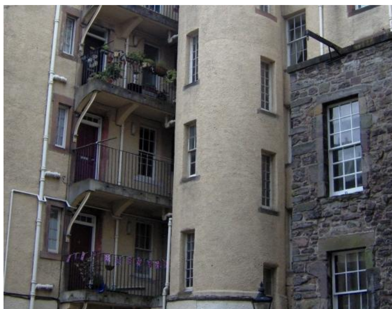
Figure 11 Lady Stair Court 2 with its access to the balconies (from Harwood & El-Manstrly, 2012b)

This community is represented by a variety of community associations. Two prominent associations are the Edinburgh Old Town Association (formed 1975) and the Edinburgh Old Town Development Trust (formed