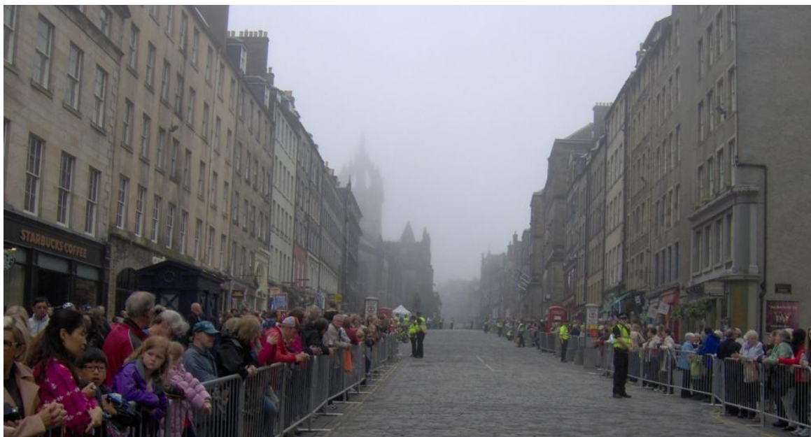
Figure 10 A view looking up the High Street towards St Giles Cathedral, with a crowd awaiting the Queen to make the return journey from the Thistle Service of The Order of the Thistle (5th July 2012) (from Harwood & El-Manstrly, 2012b)

In contrast to the retail sector is a local community comprising approximately 6,000 residents. It might not have a prominent profile on the front street. The high walls of the buildings, pitted with opaque windows, rising above the non-residential properties at street level, disguise any form of habitation (Figure 10). However, a visit to the rear of the Royal Mile provides a glimpse into its living community though the way people with front doors on balconies utilise this visible space, perhaps with plants in pots or a stream of flags (Figure 11).