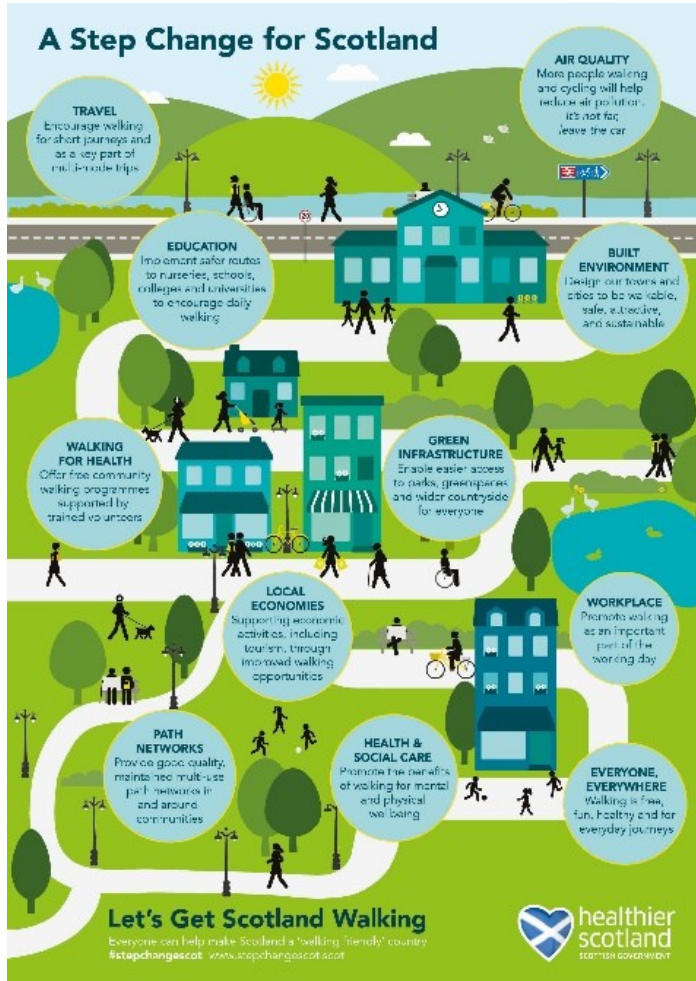
Figure 2. Infographic. A Step Change for Scotland.

The percentage of adults who walked for more than 30 minutes at a time for recreation in the last four weeks has increased since 2012, from 59% to 67%.