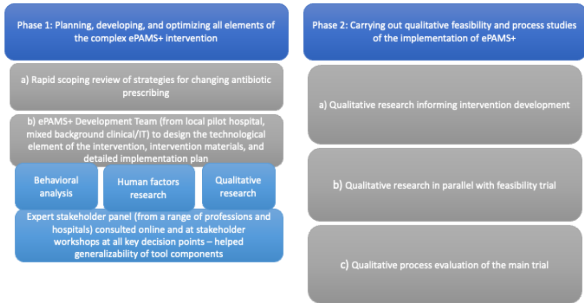
Figure 1. Overview of the qualitative work. ePAMS+: electronic Prescribing-Based Antimicrobial Stewardship Plus.

The developed intervention was called ePAMS+. Its technological and behavioral and educational components are summarized in Textbox 1 and Figure 2 . The logic model