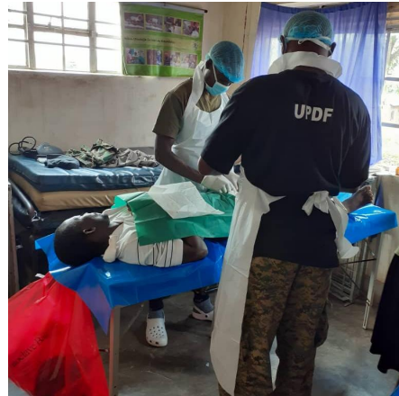
Figure 4. Reaching soldiers in hard-to-reach outposts and Figure 5: Performing VMMC at a mobile theatre

spot checks. Routine supervision and spot checks are undertaken by URC-DHAPP/UPDF-DHIV to ensure that quality service delivery is maintained at all times. Bailey et al [27] advise that all adverse events related to the VMMC intervention must be resolved urgently. Any adverse events reported to the facility post 48 hours were managed and documented. Further, follow up was conducted through continued contact and information sharing between the mobile and resident teams through telecommunication. Adverse Events (AE) were reported and the teams worked hand in hand depending on the severity 1 . All the data about procedures and follow up activities was confidentially stored.