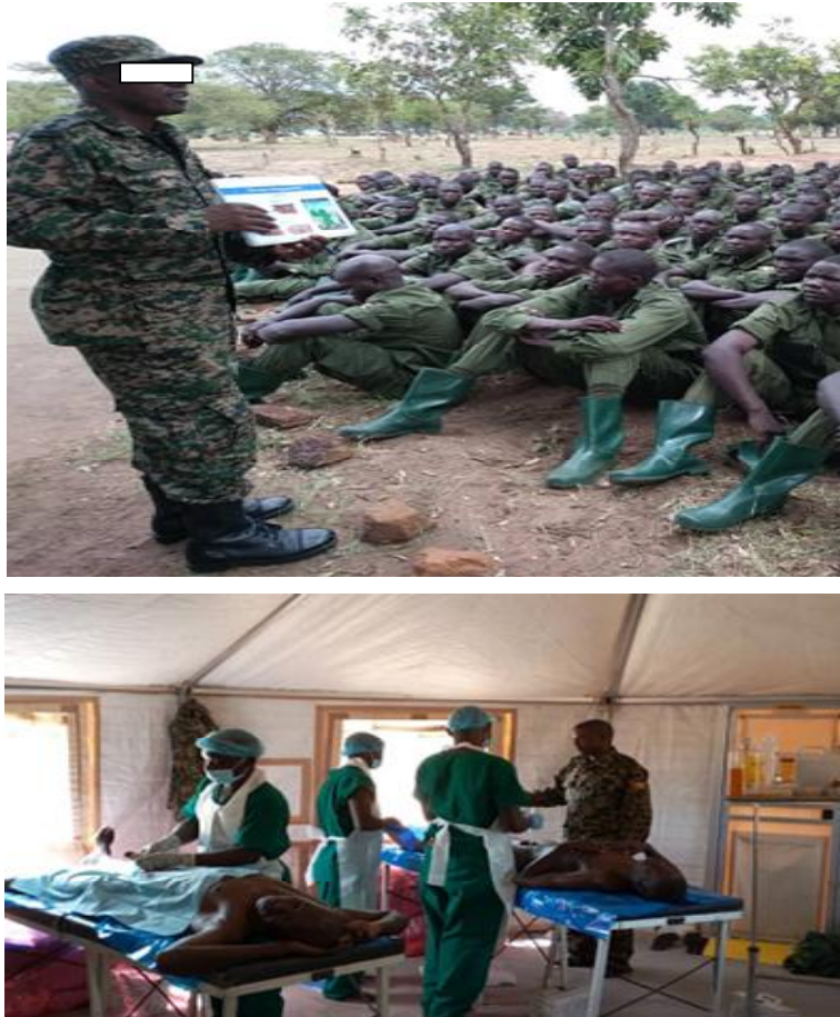
Figure 3. (Above) A UPDF commander sensitizes his troops about VMMC; and (below) surgeons performing VMMC procedures in a military post

quality service within the confines of the deployment or the working conditions of the troops was a priority. The overall VMMC team members included a team leader, counsellor, laboratory technician, vaccinator, two surgeons, and four surgical assistants. Before surgery, URC provided client health education and preparation to ensure that eligible adults from the military areas and surrounding communities are circumcised. This was done with a clear division of roles. For instance, the provider team comprised of a resident clinician and nurse who mobilised clients and ensured that post wound care is done after departure of the mobile teams. Daily VMMC camp reports were shared with the UPDF (Uganda People’s Defence Forces (UPDF) Directorate of HIV (DHIV) and URC which was important for monitoring of program performance coupled with routine supervision