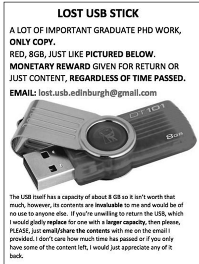
Figure 3.1 Lost USB stick

While designing domain or discipline-specific data management training can be time consuming as well as challenging, many lessons in data management really can be presented in a more generic fashion. This is because there are commonalities across domains for working with data as evidence or