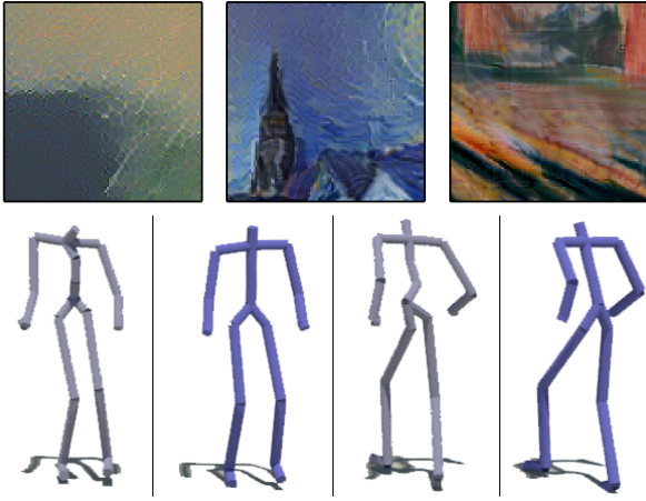
Figure 2: Images generated by deep neural networks often contain high frequency noise and other artifacts (Top). Motion generated by our transformation network (Bottom) also sometimes has these problems (Grey), but we fix this using an additional step of projecting back onto the motion manifold previously found using the convolutional autoencoder (Blue).

with automatic derivative calculation performed using Theano. We use the momentum based optimization algorithm Adam [24] to improve learning speed. The transformation network is trained for 100 epochs using a locomotion dataset of about 20 minutes of locomotion data. Training for a single style takes around 20 minutes on a NVIDIA GeForce GTX 970. Once trained the transformation network can perform the style transfer task very quickly.