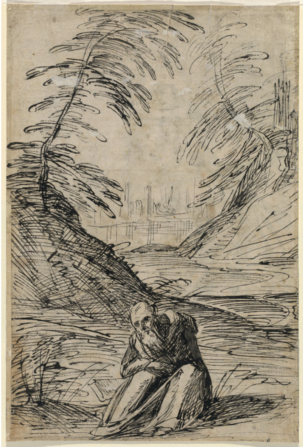
Figure 1.1. The solitary hermit has been a common theme in artistic portrayals of monastic life from Late Antiquity until the present day. This sketch shows an early modern imagination of a desert hermit: Hermann Weyer, Desert Landscape with a Hermit (verso) , 1615/1620, National Gallery of Art, Washington, DC (this image is in the public domain).