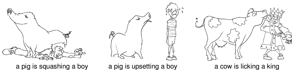
Figure 3. Actional verb and non-actional verb primes with actional verb target

Twelve actional verbs (shake, wash, tickle, push, kiss, punch, lick, hug, chase, kick, scratch, pinch) were used twice each to create 24 target items. Each target item had an actional verb and non-actional verb prime, both depicted with the same agent and patient, though a participant only saw either the actional or non-actional prime for a given target picture. There were 24 actional primes made up of six different actional verbs (hit, pat, bite, pull, squash, carry) used four times each and 24 non-actional primes created from six non-actional verbs (frighten, shock, annoy, upset, surprise, scare) used four times each.