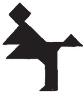
Figure 2. The ‘ice skater’ tangram.

attempt to produce alignment. Iterations of assertions and commentaries enable speakers to come to shared conceptualizations. This process occurs for both concrete and abstract concepts, but is most extensive for abstract concepts, because of the prevalence of knowledge gaps and contestability. Such dyadic exchanges lead to the formation of abstract shared concepts that extend to groups and larger communities of diverse individuals, a phenomenon that can explain society-level mechanisms for which independent groups come to share similar category systems for complex phenomena [30,34,35].