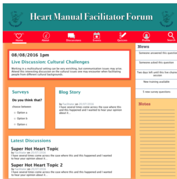
Figure 3: The home page in the final prototype

A hi-fi web-based prototype was developed by adapting the first prototype given the feedback gathered. It was presented on a browser and made from linked screens to generate a feel of the interactions that would take place (see Figure 3). Its main difference to the first prototype was that users could interact with