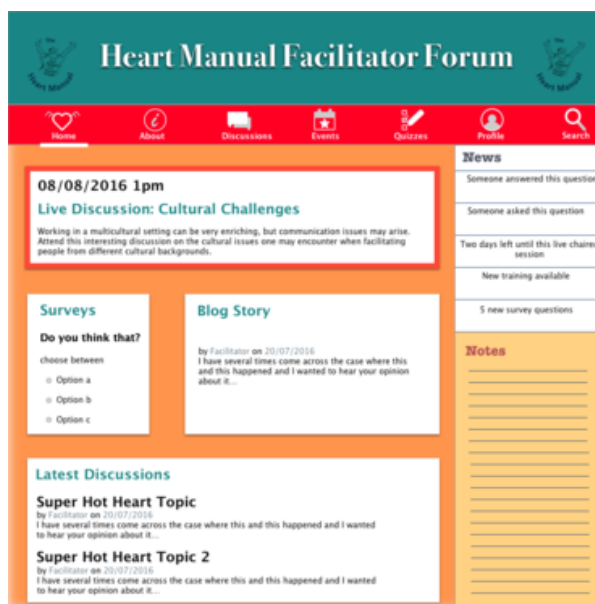
Figure 3: The home page in the final prototype

A hi-fi web-based prototype was developed by adapting the first prototype given the feedback gathered. It was presented on a browser and made from linked screens to generate a feel of the interactions that would take place (see Figure 3). Its main difference to the first prototype was that users could interact with