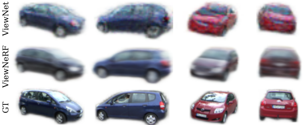
Figure 3: Comparison of reconstructions from the unsupervised ViewNet and ViewNeRF on held-out test instances from the Freiburg Cars dataset.