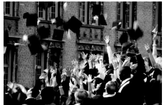
There are significant social inequalities among UK graduates. © Flickr, Andree Ludtke.

Research on social mobility has shown that this social advantage cannot be fully explained by differences in educational attainment. Children with more educated parents or parents in professional jobs are more likely to get better jobs than children from less advantaged families who achieved the same levels of education. Focusing on higher education graduates, our study