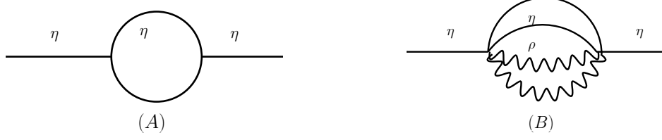
Figure 1: Diagrams contributing to the \eta propagator.