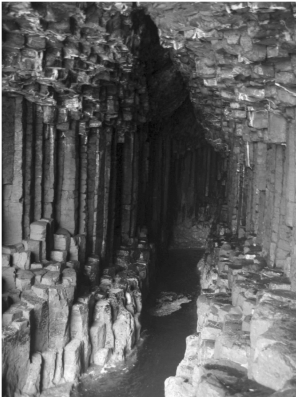
Plate 2: “. . . like the inside of an immense organ, black and resounding”: Fingal's Cave, Staffa.