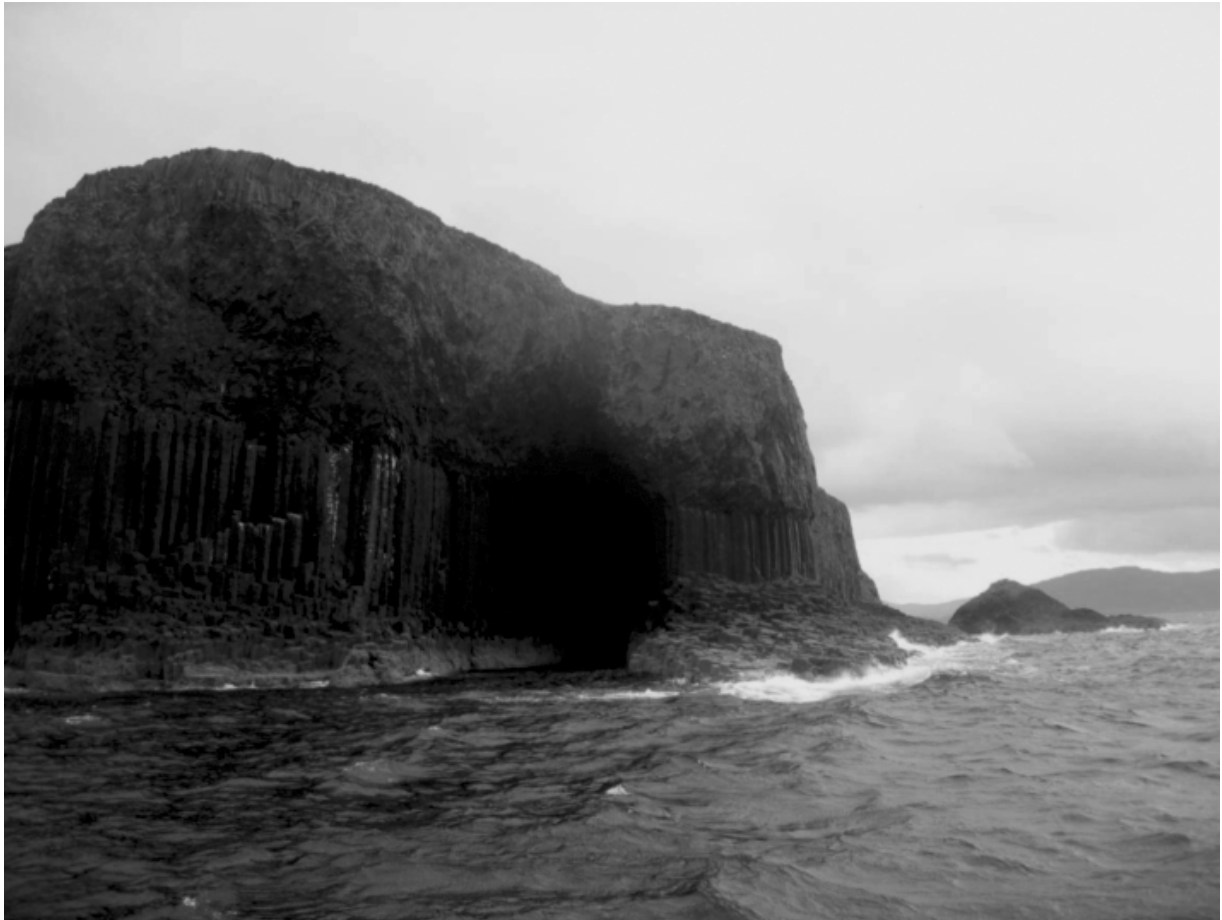
Plate 3b. Staffa: Fingal's Cave, viewed from the south.

purely mimetic, capturing dynamic and sensory qualities as conveyed to a subject rather than focusing on any referential verisimilitude to distinct material objects; not narrative so much as symbolic of the ecology between man and nature. Obviously, over and above the inevitable distinctions between music and visual art (most clearly the fact that Mendelssohn's seascape is able to move in the same piece between calm and storm, tranquil beauty and rough violence), there are differences between the two artistic visions. Mendelssohn's work is manifestly more "beautiful" in places, and the forces of modernity glimpsed (heroically?) in Turner's rather ugly steamboat have no parallel in the composer's piece, but important for each is the larger vision of conflicting forces, of the sign of the human swallowed up within nature.