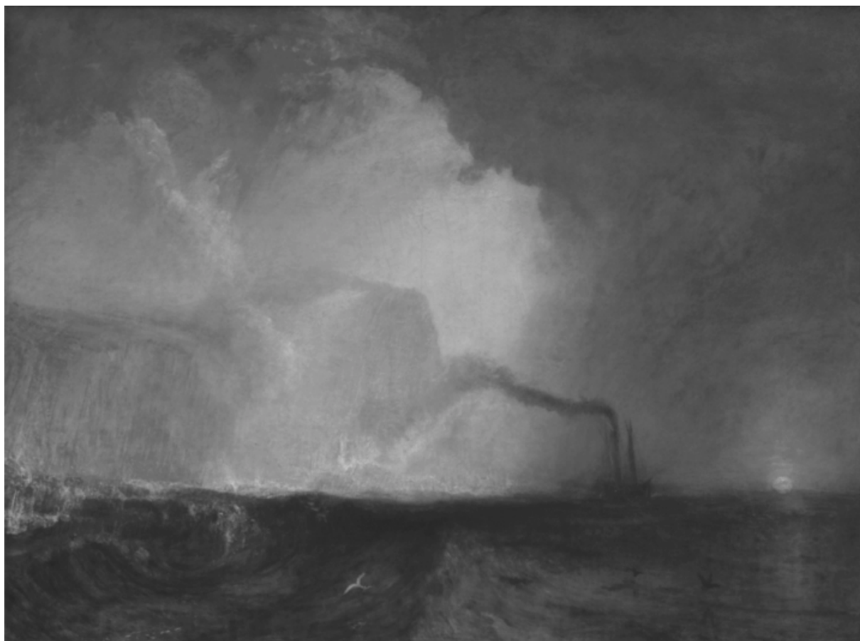
Plate 3a. Joseph Mallord William Turner, Staffa, Fingal's Cave (1831–32). (Oil on canvas, Yale Center for British Art, Paul Mellon Collection, image courtesy of the Center's website, public domain.)

streaming dirty smoke-stack of the boat battling within, attempting to capture dynamic quality of nature ( natura naturans ) in a “moving painting” (an even more dramatic and celebrated example is given in his later “Rain, Steam and Speed: The Great Western Railway” of 1844). This small, rather dirty steamship (depicted disproportionately small in relation to the true size of the landmass, seemingly dwarfed by the natural elements around) is caught amid the overpowering sweep of the elements, a fragile sign of humankind within the might of natural sublime. Water permeates almost everywhere in various forms, as sea, cloud, or mist. The lurid yellow disk of the sun (rising or setting in unlikely fashion almost due north) offers a brief suggestion of warmth, but (like the