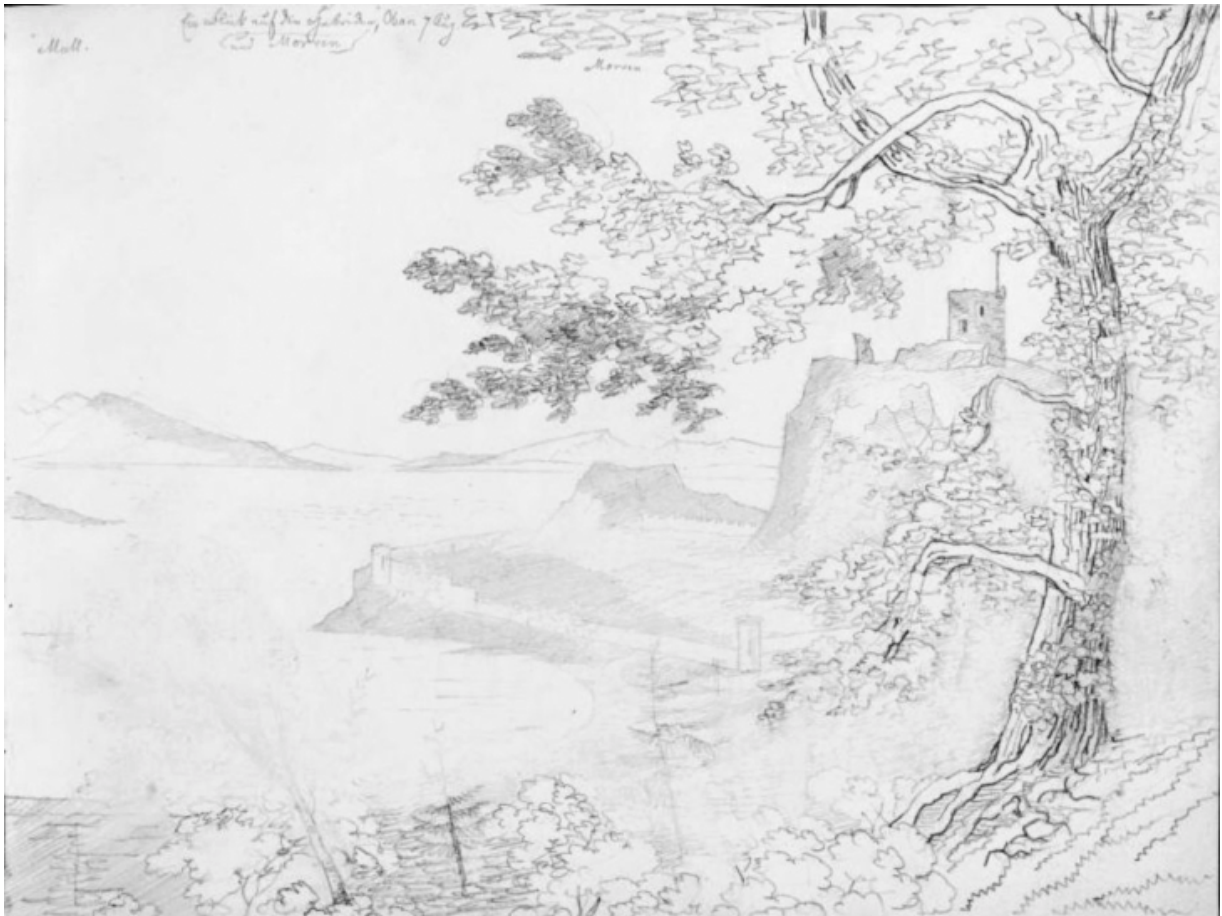
Plate 1a. Mendelssohn, sketch "Ein Blick auf die Hebriden und Morven," letter to family, Tobermory, 7 August 1829 (Bodleian Library, University of Oxford, MS. M. Deneke Mendelssohn D.2, Fol. 28, reproduced by kind permission). It is rarely noted that Mendelssohn's "View of the Hebrides" is in fact almost entirely of the Scottish mainland.