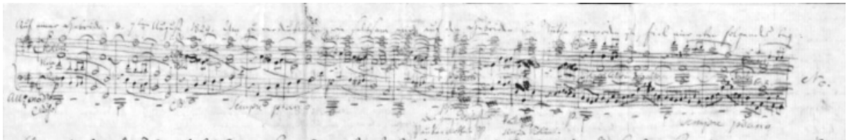
Plate 1b. "In order to make you understand how extraordinarily the Hebrides affected me, the following came to my mind there": Mendelssohn, musical sketch [start of future Hebrides Overture], letter to family, Tobermory, 7 August 1829 (New York Public Library, psnypl_mus_737 Mendelssohn, Felix;).