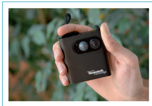
Figure 1. The Sensecam.

The Sensecam is a small, light (93 g) camera and is worn on a lanyard around the neck, resting on the user's chest. The Sensecam comprises a camera (640 × 480 pixels) with a fish-eye lens to provide a horizontal 130-degree field of view. 32 The Sensecam automatically captures at least one image every 30 seconds (Figures 2 and 3).