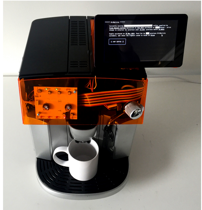
Figure 1. Bitbarista ready to serve

Since modernists claimed that less is more , principles of minimalism and simplicity have become increasingly influential in design. In Interface Design, Norman [21] classically advocated for interfaces that are clear from clutter and distraction, allowing users to focus on the task at hand. Nielsen [20] defended the need for interfaces where dialogues do not contain information that is “rarely needed”. Although much has happened in interface design since then, the drive for minimal information remains largely influential. Apple Inc. is