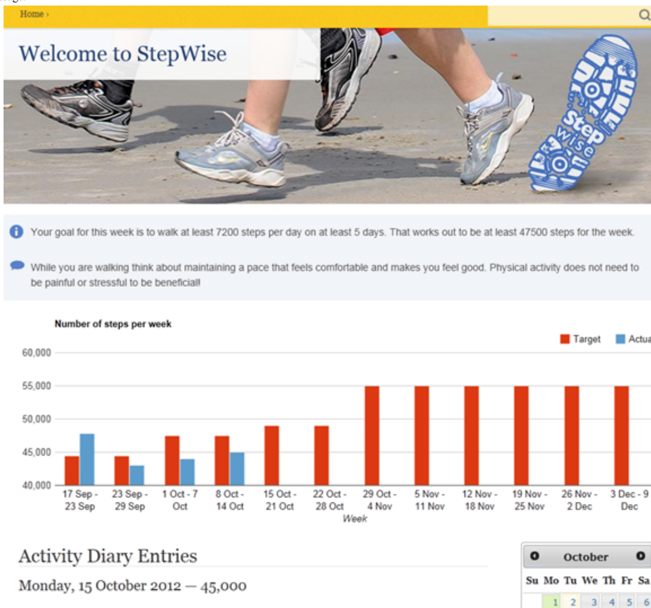
Figure 2. The graph showing step goals and number of steps achieved each week and the step goal for the following week along with a motivational message.