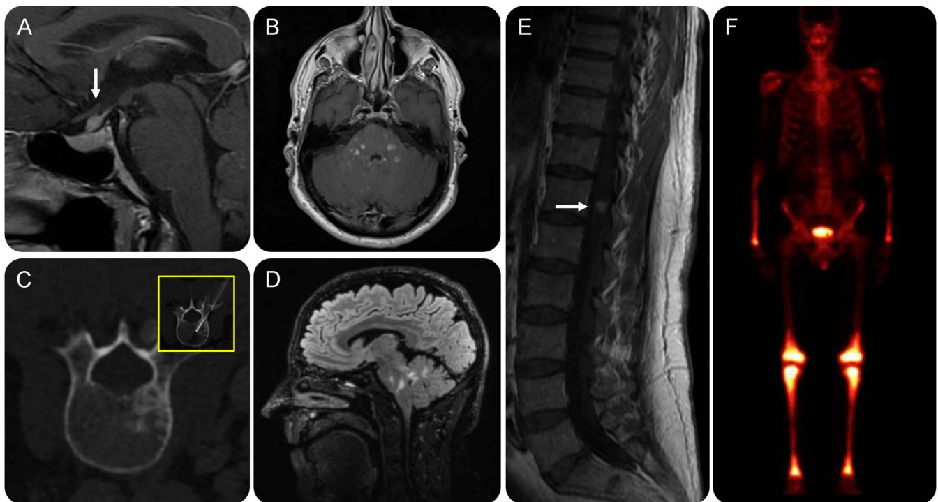
(A) Isolated infundibular lesion (arrow) causing diabetes insipidus at presentation. (B) Gadolinium-enhanced MRI scan of the brain; axial sections through pons show multiple enhancing lesions. (C) CT scan of spine shows isolated vertebral sclerotic lesion (biopsy shown was negative for lesional tissue). (D) Sagittal fluid-attenuated inversion recovery MRI of brain shows lesions distributed throughout the pons and cerebellum. (E) Enhancing lesion in cauda equina (white arrow). (F) Bone scan shows characteristic uptake in the long bones (femur, tibia).