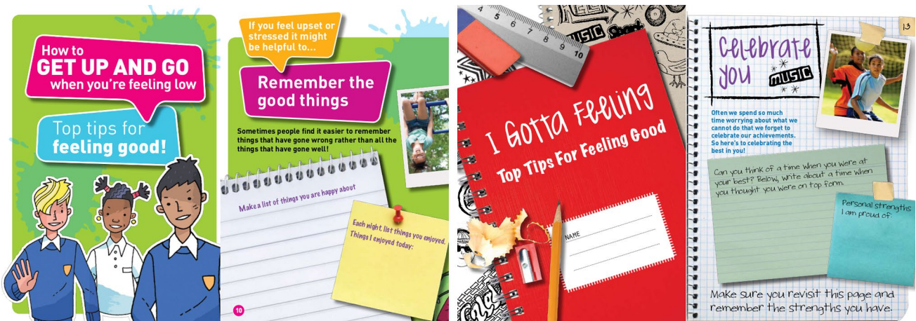
Fig. 1 Example pages from the intervention booklets, “ How to Get Up and Go When You’re Feeling Low ” (left panels) and “ I Gotta Feeling ” (right panels). Copies of the booklets are available from the authors

hindered by low mental health literacy and stigmatising attitudes towards mental health problems [8]. The provision of booklets and other forms of information have been recommended as potential low-cost routes for promoting improved recognition of mental health symptoms in young people [9]. Increased knowledge about mental health problems has also been shown to be associated with improved self-management, such as appropriate help seeking [8, 10, 11]. Given the potential for wide dissemination of information booklets, even very small effects of this type of intervention may translate into meaningful impact on mental health and well-being at the population level. However, rigorous evaluation is needed to determine whether this is indeed the case.