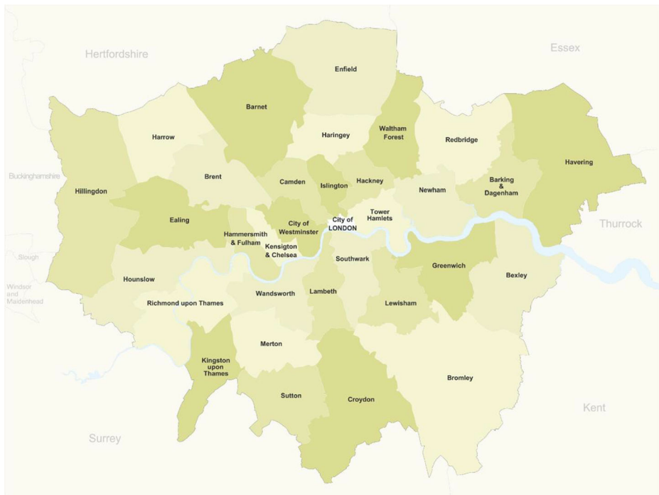
Figure 1. Map of London Boroughs