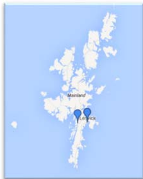
Fig. 2 Distribution of interviewees (Strathclyde), by places worked during career (N = 23).