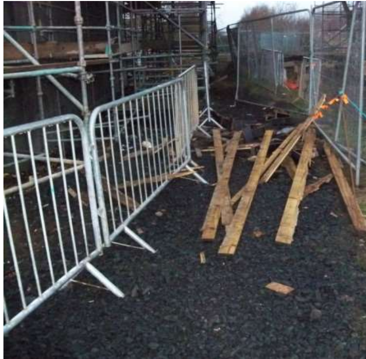
Figure 3 – Planks in the access route creating trip hazards