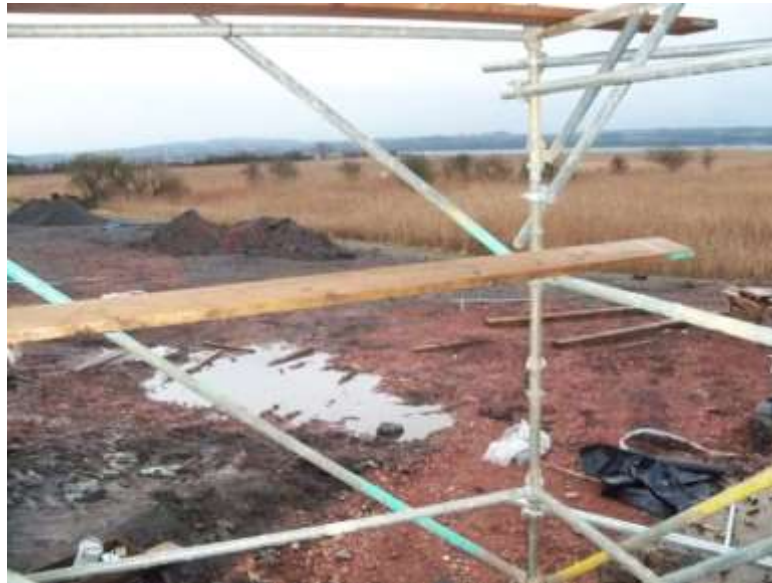
Figure 2 - Planks placed at the end of a scaffold

This process of verifying what is observed through conversations with other participants in the setting significantly reduces the risk of misinterpreting evidence.