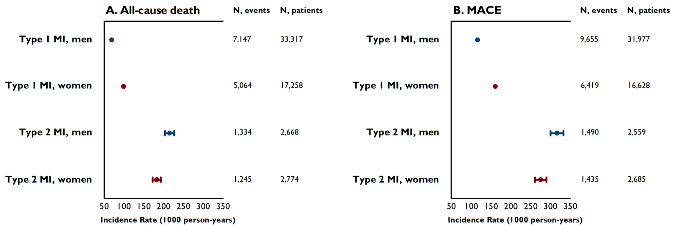
Figure 3 Sex-specific incidence rates (and their 95% CIs) per 1000 person-years of all-cause death (panel A) and major adverse cardiovascular events (MACE) (panel B) for patients with type 1 and type 2 myocardial infarction (MI). MACE is defined as a composite end point of all-cause mortality, readmissions for non-fatal MI, heart failure and ischaemic stroke.