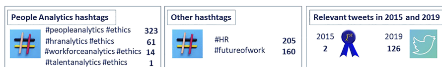
Figure 3. Twitter results info graphics

Relevant issues identified in the PA literature fell into two broad categories – ethical risks (and conversely opportunities) and recommendations, with a range of specific themes evident within each of these, as summarized in Table 1.