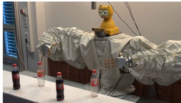
Figure 5: In the BIMANUAL scenario, a camera is used to recognise empty bottles which a bimanual robot should remove from to a “dishwasher” location on the left side, behind the table (Gaschler et al. 2013a; Giuliani et al. 2013).

precondition other than the requirement that the knowledge it gathers must be new. For manipulation, both robot arms can perform the pickUp and putDown actions. Not all locations can be reached by both hands, so the preconditions of these actions include an extern call to isReachable , which is defined in a motion planning library and which checks reachability for a specific hand and location.