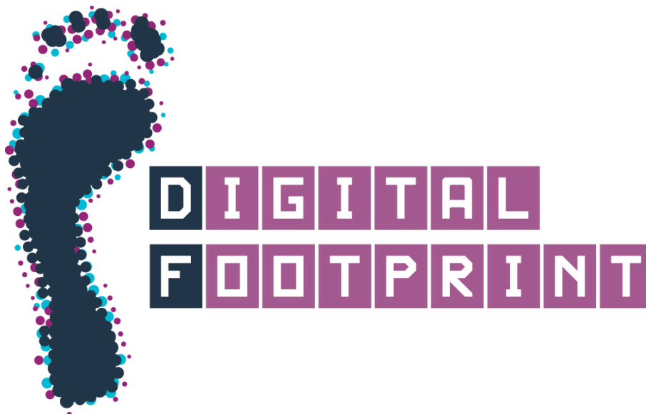
Figure 2: Digital Footprint campaign logo (2014-15)

The campaign has been promoted via a website (IAD 2014) and a number of social media platforms. The promotions strategy includes a logo (Fig. 2), online platforms, print materials, pens, competitions, workshops as well as a staff briefing paper. Many of the promotional activities have also been undertaken by the campaign collaborators, ensuring a wider outreach and possible impact. For example workshops have been jointly delivered by the Careers Service (focusing on the use of LinkedIn) and the Institute for Academic Development (focusing on managing a digital footprint).