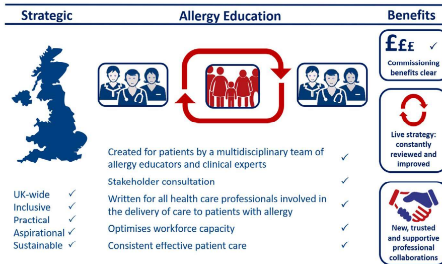
FIGURE 1 Developing our National Allergy Education Strategy. The National Allergy Education Strategy has been written by a multidisciplinary team of HCP, for all HCP across the UK, with the patient at the centre. Our vision is to ensure that quality education is available to all HCPs in a manner that is appropriate to their professional roles. This inclusive strategy will lead change and innovation in the systems that support education and training of HCPs so that access to, and expectation of allergy competencies become established norms at all stages of training. Commissioners will be able to deliver integrated care services and to train and optimize workforce agility and flexibility so ensuring consistent, effective patient care

advocate on behalf of their patients as well as the camaraderie of a learned professional and multi-disciplinary community. Improved cost-effective care and reduced per capita costs and health risks will lead to rewards in the well-being and care experiences of both caregivers and patients. The triple aim of improving health of populations, enhancing individuals' experience of care and reduced costs can be elevated to the quadruple aim by adding joy in work of health staff. Good relationships, communication and trust are key to integrated care. Education and bringing people together through networks and communities of learning and practice are fundamental here.