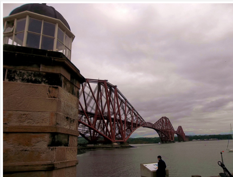
The Bridge to Independence?