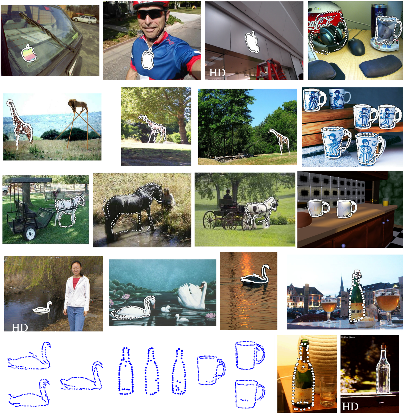
Figure 4. Example detections. Results are based on models automatically learnt from images, except those marked with ‘HD’, which use a hand-drawing from [7] as model. The rightmost case of the top row includes a typical false positive, and the image below it illustrates multiple detected instances (one missed). In the first two images of the third row, the horizontal line below the horses’ legs is part of the model and represents the ground. Interestingly, the ground line systematically reoccurs over the training images for that model and gets learned along with the horse. Bottom row: models produced by our approach from different random image subsets. They represent prototypical shapes for their respective class. Similar shapes are produced from different training images, indicating the stability of our learning technique.