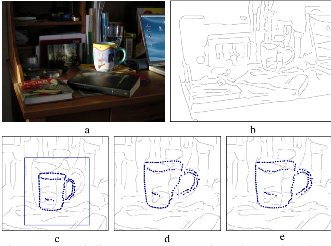
Figure 3. a) A challenging test image and its edgemap b) . The object covers only about 6% of the image surface, and only about 1 edgel in 17 belongs to its boundaries. c) Initialization with a local maximum in Hough space. d) Output shape with unconstrained TPS-RPM. e) Output shape with shape-constrained TPS-RPM.

representing 95% of the total variance, we can approximate the region in which the training examples live by \bar{x} + E_{1:n}b , where \bar{x} is the mean shape, b is a vector representing shapes in the subspace spanned by E_{1:n} , and b 's i^{\text{th}} component is bound by \pm 3\sqrt{\lambda_i} . This defines the valid region of the shape space, containing shapes similar to the example ones. Typically, n < 15 eigenvectors are sufficient (compared to 2p \simeq 200 ).