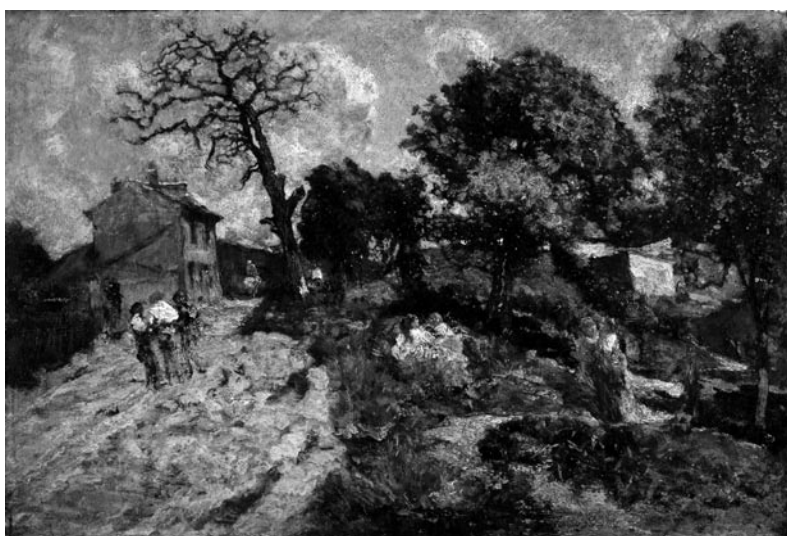
6. Adolphe Monticelli, The New Vintage , 1849, oil on canvas.