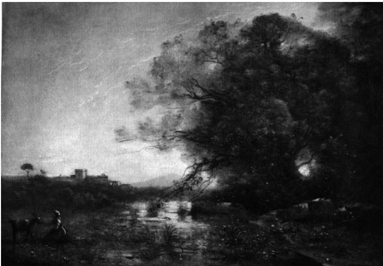
4. Camille Corot, The Swamp by the Large Tree with a Goatherd , 1850–5, oil on canvas. Private Collection