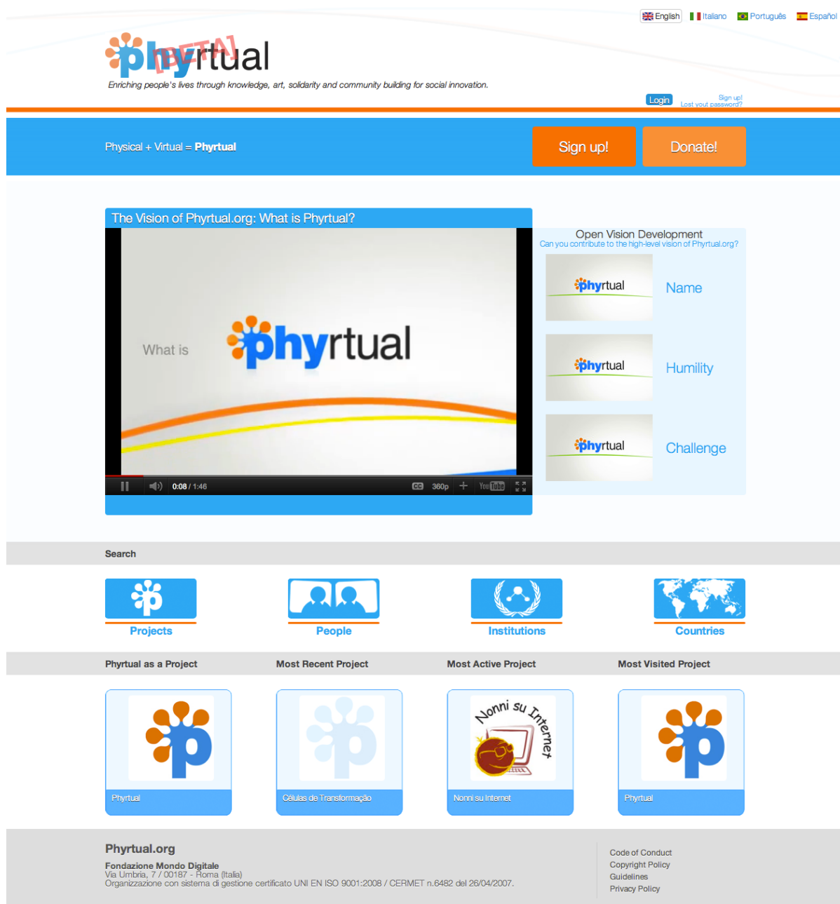
Figure 1. Phyrtual Home Page

Figure 1 shows the Phyrtual Home Page. The top marked area is dedicated to communicating the vision through videos and phrases. This area introduces the concept of open vision development since it is open to video contributions from anybody who may have something exciting to add to the vision of Phyrtual. The purpose is to maintain the vision always creative and challenging through a process of collaborative vision making. The “Sign up” and “Donations” buttons are also found in this area. Donation is central to the Phyrtual income-raising model (“ crowd financing ”). Eventually, it will be extended to all projects inside Phyrtual ( i.e., diffuse crowd financing ).