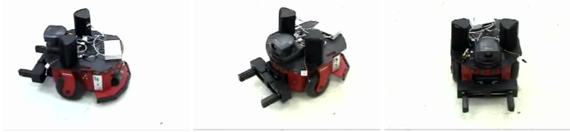
Figure 2: The robot engaged in the left turn action

“backs”, “backing”, etc. Likewise, “turns” was used with “left”, while “turning” was used with right. These results are symptomatic of the very real problem that accidental correlation can (and most likely will) occur. This is an instance of over-fitting, a problem which plagues nearly all learning. In meaning acquisition, one potential solution is the addition of hypothesis testing by the learner, or a language game such as those proposed by Steels to provide a mediator to aid the learning system in correcting misinterpretations.