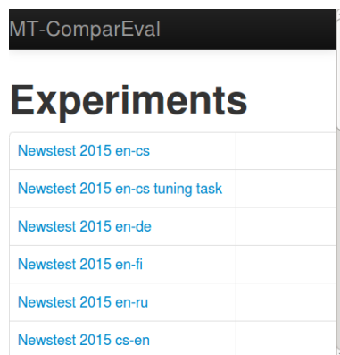
Figure 1. Part of the start-up screen of the evaluation panel with a list available experiments at wmt.ufal.cz .

Once the user selects an experiment, an evaluation table with all relevant tasks (Figure 2) is shown. The table contains (document-level) scores for each task entry calculated by (a selected subset of) the included automated metrics. The panel also includes a graphical representation to monitor the improvement of the scores among different versions of the same system. 6 The metrics currently supported are Precision, Recall and F-score (all based on arithmetic average of 1-grams up to 4-grams) and BLEU (Papineni et al., 2002). 7 MT-ComparEval computes both case-sensitive and case-insensitive (CIS) versions of the four metrics, but the current default setup is to show only case-sensitive versions in the Tasks screen. Users are able to turn the individual metrics on and off, to allow for easier comparisons.