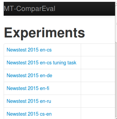
Figure 1. Part of the start-up screen of the evaluation panel with a list available experiments at wmt.ufal.cz .

Once the user selects an experiment, an evaluation table with all relevant tasks (Figure 2) is shown. The table contains (document-level) scores for each task entry calculated by (a selected subset of) the included automated metrics. The panel also includes a graphical representation to monitor the improvement of the scores among different versions of the same system. 6 The metrics currently supported are Precision, Recall and F-score (all based on arithmetic average of 1-grams up to 4-grams) and BLEU (Papineni et al., 2002). 7 MT-ComparEval computes both case-sensitive and case-insensitive (CIS) versions of the four metrics, but the current default setup is to show only case-sensitive versions in the Tasks screen. Users are able to turn the individual metrics on and off, to allow for easier comparisons.