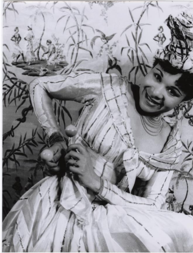
Fig. 3. Carl Van Vechten, Katherine Dunham, No. XI. May 1940.

direct gaze at the camera – suggests a sardonic self-awareness, evaluating a primitivist attitude that would couple crude notions of Negro culture with modern black creative pursuits: a critique enabled, in this instance, by Van Vechten’s pointed mise-en-scène .