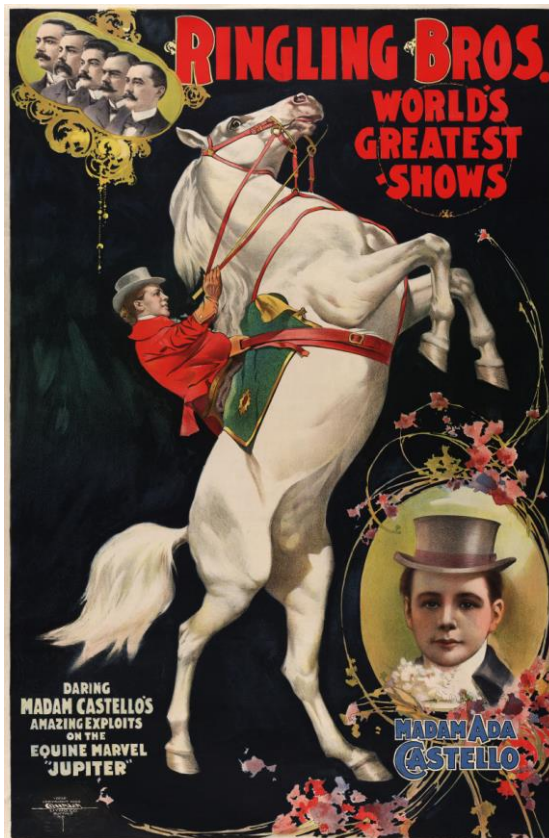
Fig. 2 Ringling Bros. World's Greatest Shows: Madam Ada Castello . Promotional poster for Ringling Brothers by the Coach Lithographic Co., Buffalo, New York, ca. 1899.

movement is once again framed as an interplay between external prompt and involuntary response; this ‘idiot dwarf’ is ‘hooked to a wire to make him jump’, recalling the ‘wire-pulled automatons’ and ‘horrible marionette’ of Wilde’s decadent poem ‘The Harlot’s House’ (1882), which also depicts an automated mode of eroticism communicated through impersonal gestures and movements. 49 As such, the artifice-laden choreographies of ‘Crab-Angel’ expose both the performative appeal of the circus and the similarly constructed nature of sexual and racial categories, inscribed at surface-level through the body’s mechanisation.